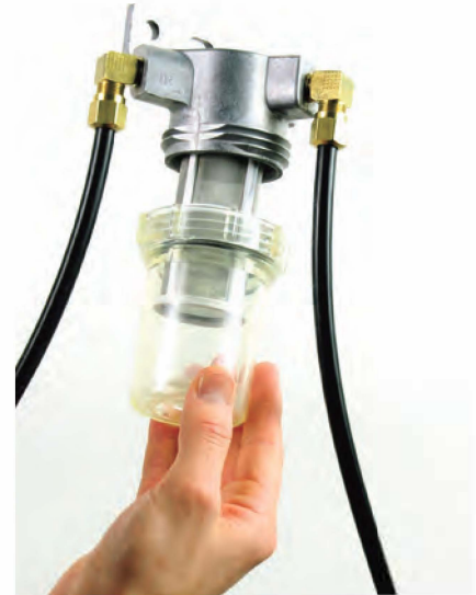
Kits 10-438 and 10-443 include pre-strainer body, bowl and screen, plus 5 Micron filter and mounting hardware.