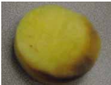
Fiberglass Filter Media

Competitive driers use fiberglass as a filter media while the Thermo King drier uses a higher quality filter media. Fiberglass is known to lose fibers, which can clog TXV and solenoid ports downstream of the filter drier and prevent proper cooling. Benefits of the Thermo King design include virtually no overheat risk (since cooling flow is maintained) and a reduced risk of load loss due to inadequate cooling.